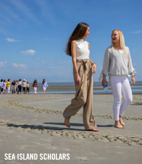
SEA ISLAND SCHOLARS

SEA ISLAND SCHOLARS is an annual experiential learning opportunity with notable Terry alumnae and supporters. It offers selected Terry students an inside look at the business operations at Sea Island and the chance for them to develop personal and professional goals. Students engage in lectures, discussions and team building through outdoor activities.