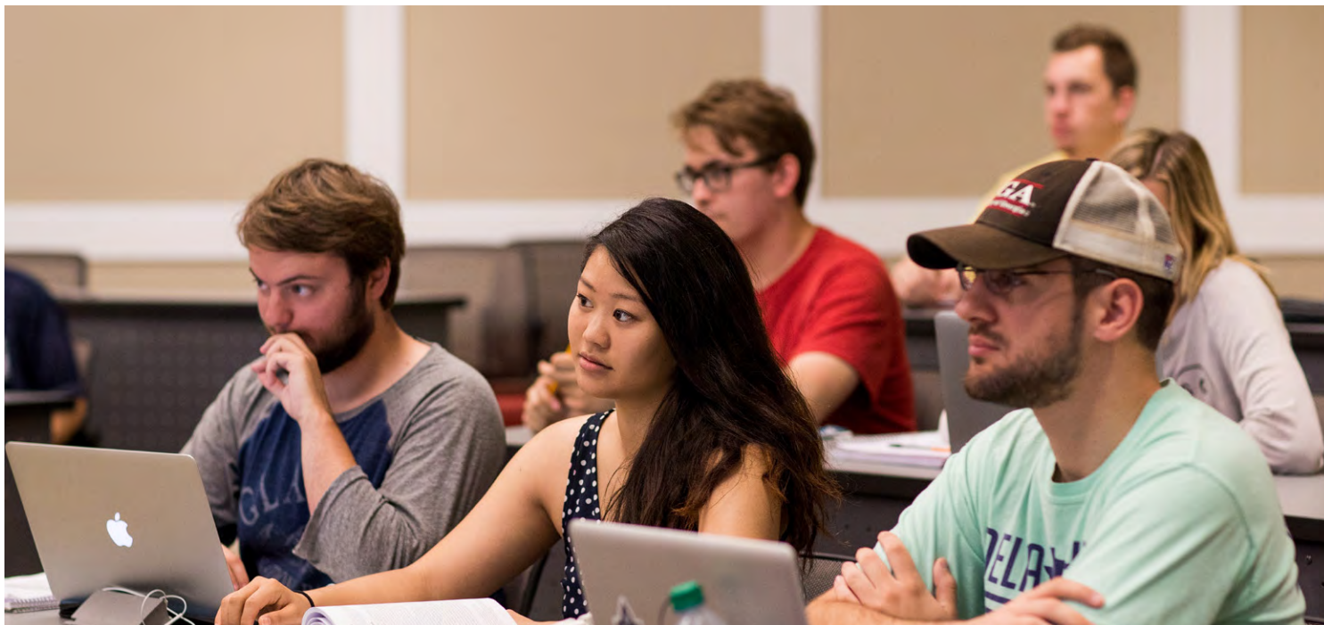
Terry College students listen intently during a class inside the KPMG Classroom in Benson Hall. Benson Hall features six large classrooms — three on the ground floor and three on the first floor.

young men that went out and did just that all over the United States.”