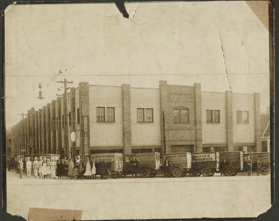
Benson's Bakery 1918 Athens, GA