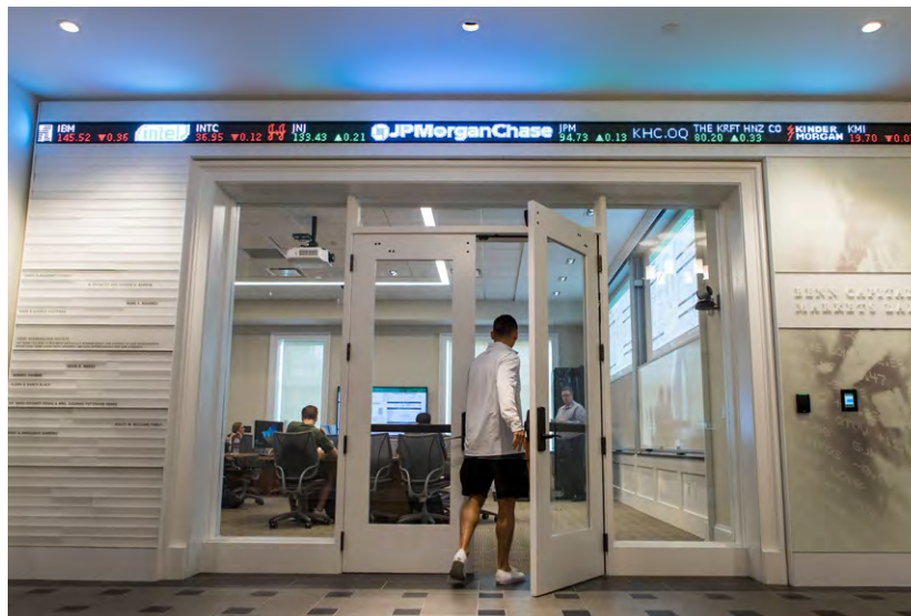
The Benn Capital Markets Lab allows students to watch and learn about international finance in real time.