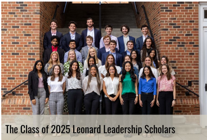
The Class of 2025 Leonard Leadership Scholars