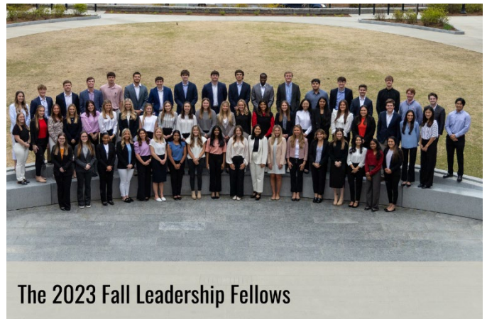
The 2023 Fall Leadership Fellows