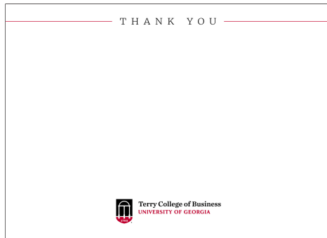
6.25 x 4.5 Flat Cards