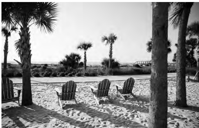
Savannah and the Golden Isles are Georgia's premiere destinations, favored by visitors and newcomers of all ages. Beach scene on Jekyll Island, Georgia