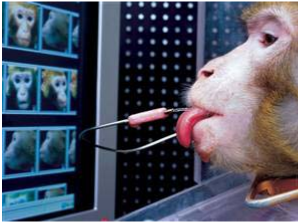
Monkey business: Monkeys are implanted with electrodes that can detect the real time firing of a single neuron