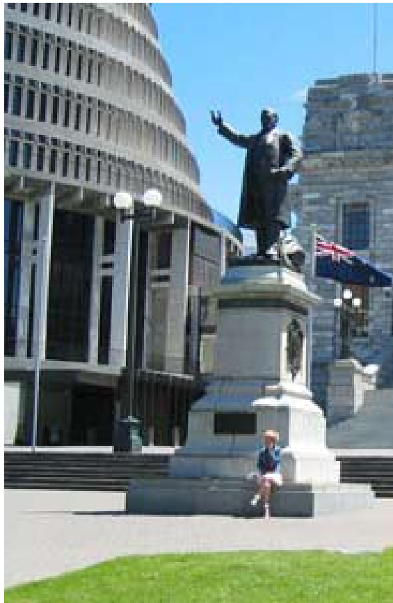
Parliament “Bee Hive,” Wellington, New Zealand

In Fiji, the students attended lectures presented by local experts in political and economic issues, and participated in a homestay at a local village where they experienced communal living including the sevusevu ceremony, and learned about the impact tourism is having on the village economy and lifestyle. Again, the group was treated to the raw beauty of the islands in the way of a rafting trip down the Navua River and a guided snorkeling exploration of a coral reef on the coast of Manta Ray, one of the Yasawa islets. This timely and engaging study abroad program gave participants a special opportunity to survey these culturally and environmentally rich islands and the unique political and economic systems that have emerged there. ■