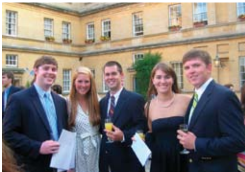
Terry '06 students before a formal dinner at Trinity College, Oxford.

Starting summer 2008, Terry MBA students will have the opportunity to study abroad at Oxford University. During this six-week summer program, in addition to taking a course at Oxford with an Oxford Don, MBA students will intern with a company in London. If your company has an office in London and offers internships, please let us know. This program is an extension of the Terry@Oxford program — a six-week summer program at Oxford University for Terry undergraduate students (see www.uga.edu/oxford for a description of the UGA@Oxford programs).